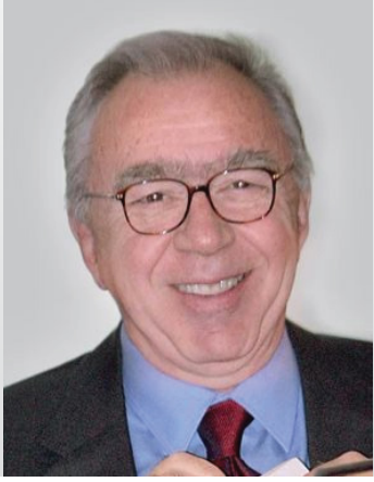
Sokratis P. Kokkalis Chairman and Group CEO, Executive Member

Visionary founder of INTRALOT and majority shareholder of the INTRACOM Group, he launched the first advanced technology hub in Greece in 1977. A leading member of the Greek business community, he is an active sponsor of leading educational, cultural and athletic initiatives in SE Europe. With degrees in Physics and Electronics, he became a John Harvard Fellow in 1997 after establishing the Kokkalis Program at Harvard University's Kennedy School of Government. In 1998 he founded the non-profit Kokkalis Foundation, a public benefit institution focusing on educational and regional development. A fluent speaker of English, German and Russian, he also speaks Romanian, Italian, Bulgarian and conversational Serbian and French. For many years he was the president and major shareholder of Olympiacos FC, Greece's leading football club.